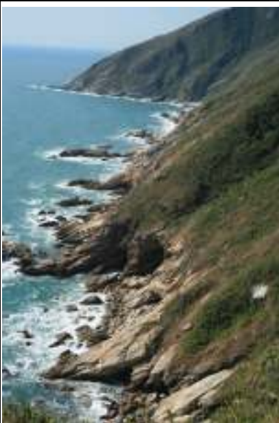
● Rugged coastline – View from Xichongkou