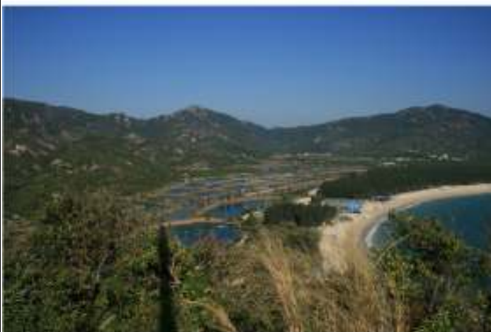
● Sand bar and lagoon with Qiniang Shan at the background.