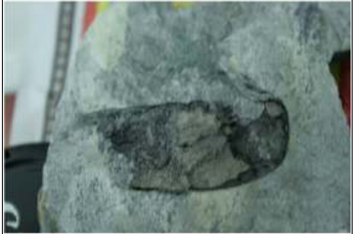
● A probable fish fossil fragment found on the beach at Xichongkou