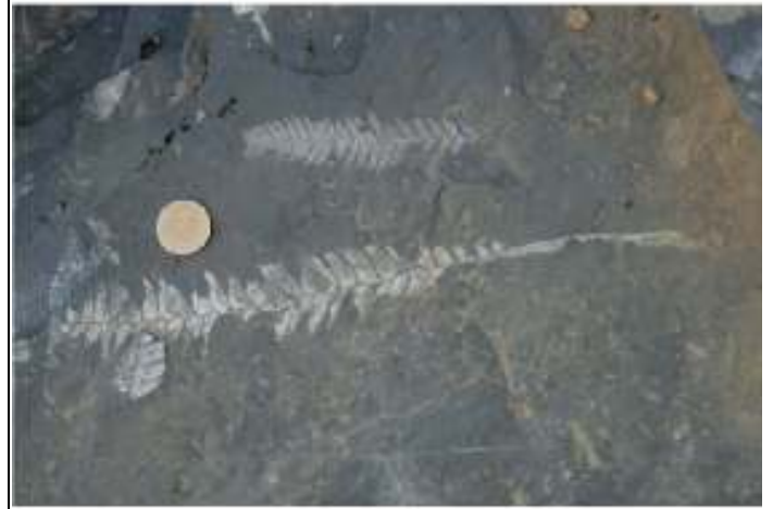
● Plant fossils at the quarry of Shuitousha.