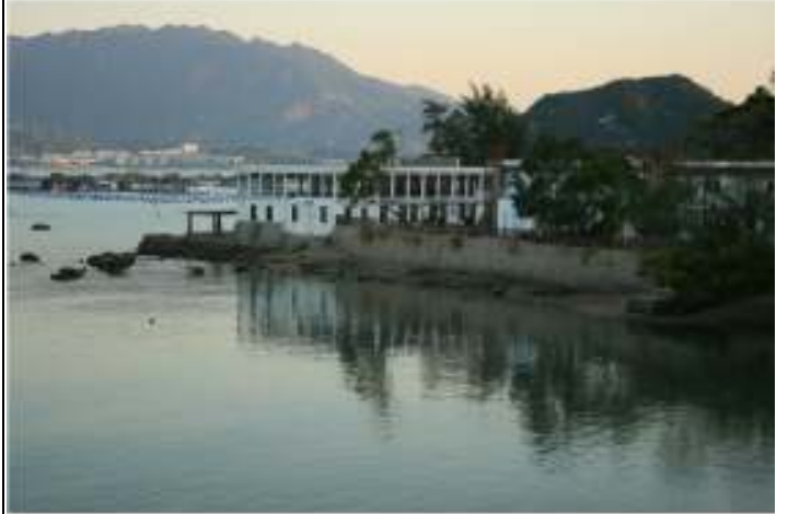
● View from hotel