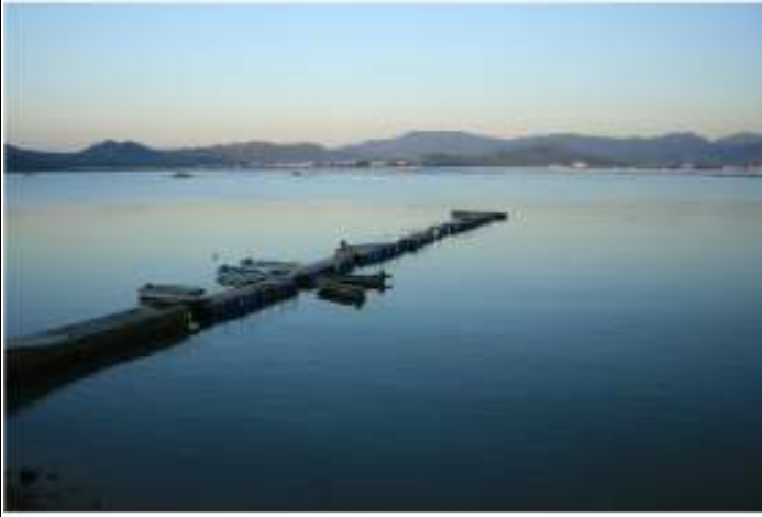
● View from hotel