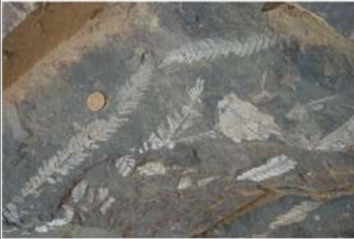
● Plant fossils at the quarry of Shuitousha.