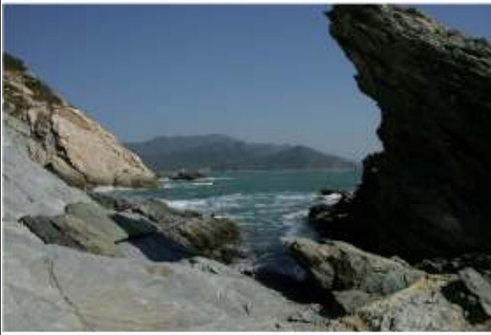
● Erosion caused by effects of wave at Xichongkou.