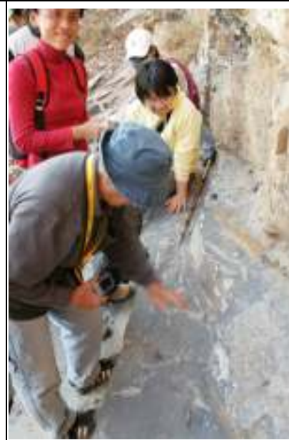
● Plant fossils in a quarry at Shuitousha